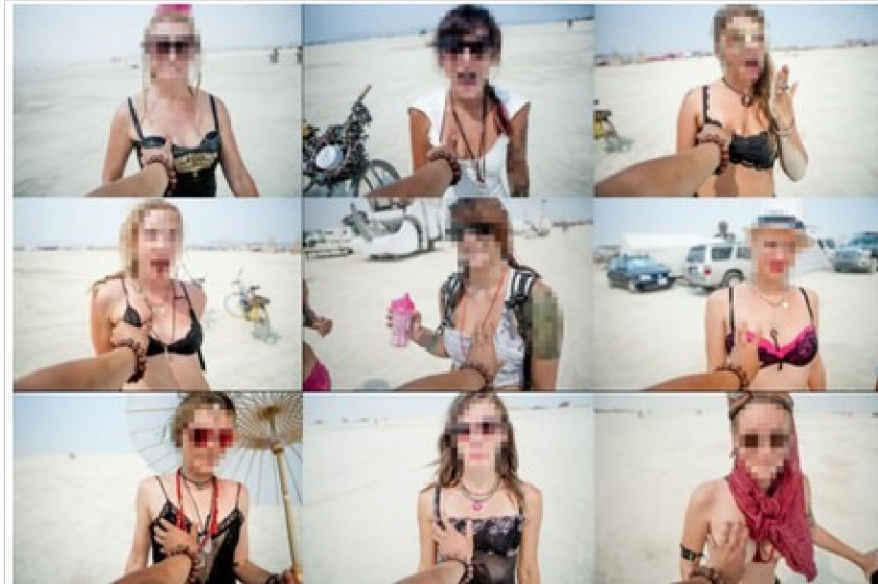
(PHOTO: The women at Burning Man allow strangers to simply walk up to them and grab their boobs)

“We’re not going to set up a Marxist state,” he said. “We see culture as a self-organising thing. And we’re unwilling to impose and mandate behavior from the outside, we want to generate change from the inside.”